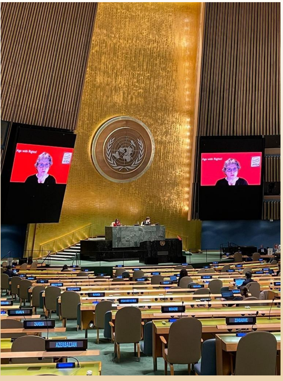
GA hall April 2021 OEWGA