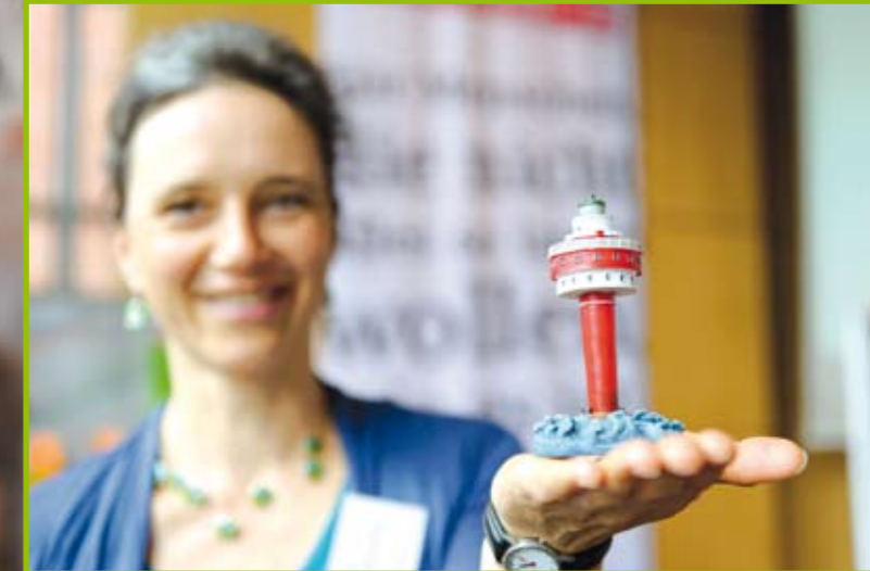
Lighthouses of engagement as "talking staffs" to support the culture of conversation.

This brochure brings together the contributions made by the speakers and the 120 conference participants: They are impulses for successfully supporting civic engagement.