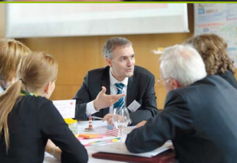
A stimulating round-table discussion.