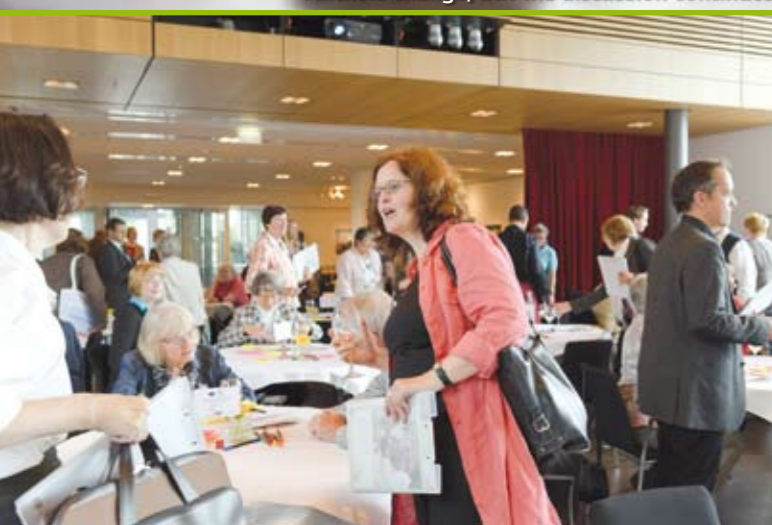
Partners change, but the discussion continues.