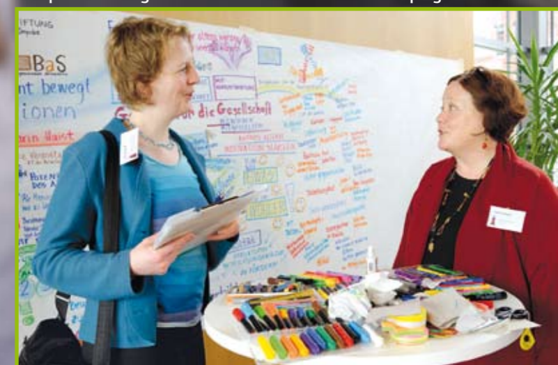
"Graphic recording" – the conference is illustrated as it progresses.