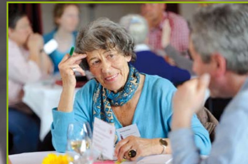
Listening, respect, articulation form the basic pillars of dialogue.