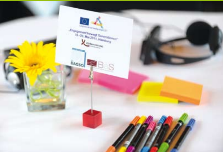
Pens, post-it notes, headsets: the conference begins.