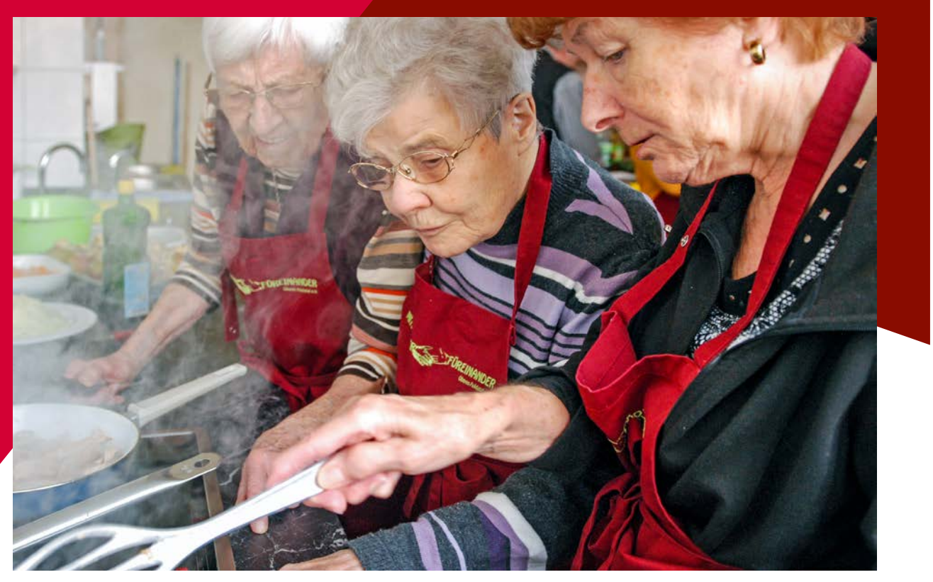
Cooking lunch together creates greater cohesion in the neighbourhood