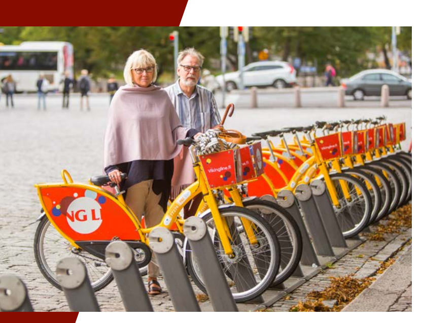
Urban mobility with bike rental stations