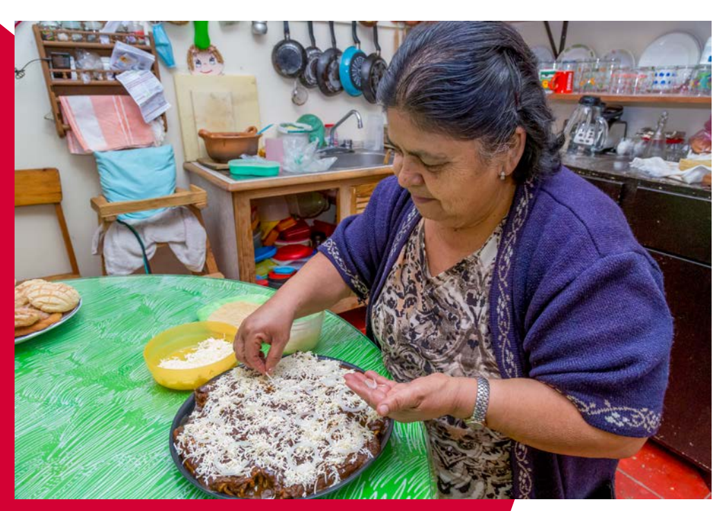
A healthy diet is also good for the climate

The town of Andernach in Rhineland– Palatinate has adopted the concept of the Edible Town . The urban green spaces are turned into vegetable gardens, where rare tomato and onion varieties were planted, among other things. The programme not only promotes biodiversity, but also a sense of community as older people pass on their gardening experience.