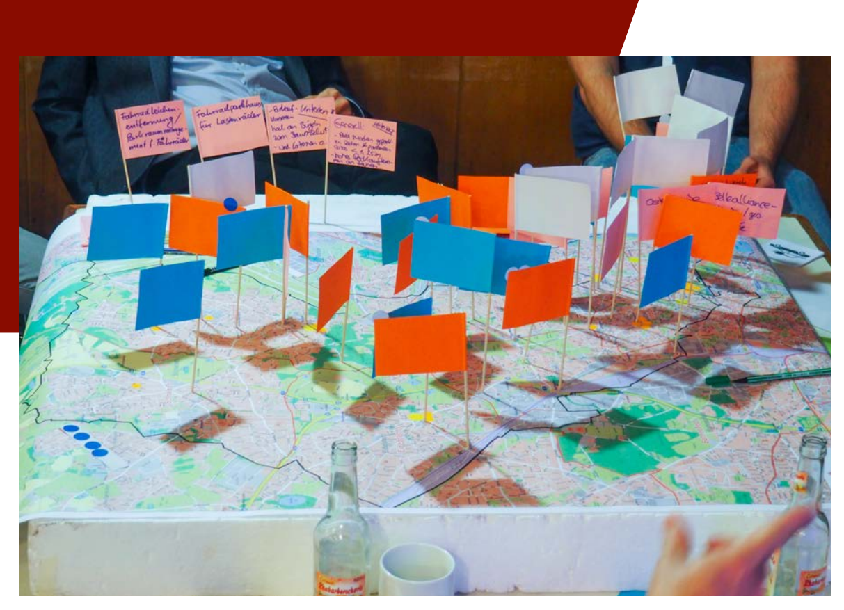
Taking stock of the age-friendly city

The follow-up study in autumn 2022 will address the topic of sustainability. What sustainable factors are important to older people?